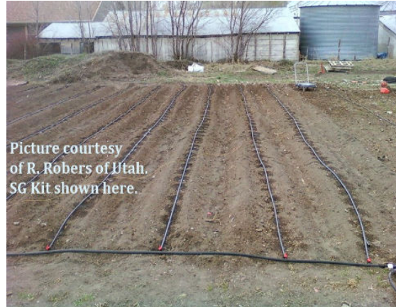
SG Kit shown here.

Please open and examine your kit carefully within 30 days of receipt of order!!