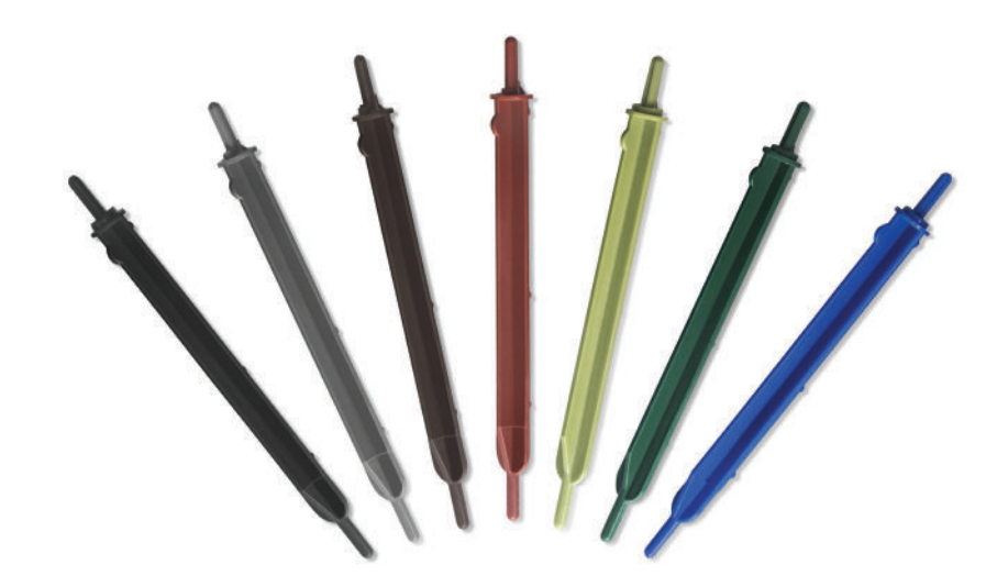
Color-coded SPOT-SPITTERs deliver a variety of flow rates and patterns. Exclusive directional indicator allows quick placement. Available options: Standard (4.75"), short (2.75"), Tall (11") and Downspray.

You can rely on Primerus Products and the AboveGround SPOT-SPITTER to deliver unmatched performance for all your mini-spray nursery and greenhouse applications.