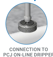
CONNECTION TO PCJ ON-LINE DRIPPER