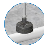
CONNECTION TO PC ON-LINE DRIPPER