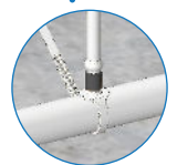
CONNECTION TO UNIRAM™