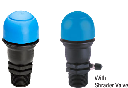
¾" & 1" GUARDIAN Air & Vacuum Air Vent

PROVEN DESIGN PROVIDES MORE AIR RELEASE CAPACITY THAN OTHER VENTS OF SIMILAR SIZES