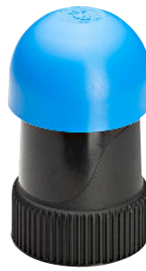
2" & 3" GUARDIAN Air & Vacuum Air Vent